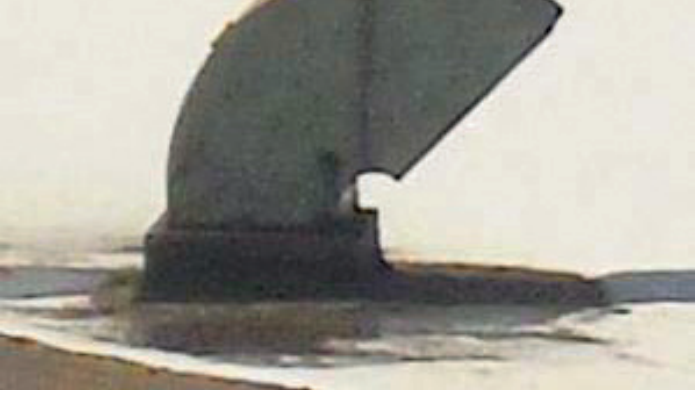
Left: Building wall openings

Right: Rooftop gooseneck air intake