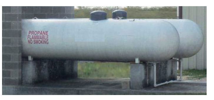
Log yard and propane tanks

However, smoke and soot may also penetrate into buildings by: