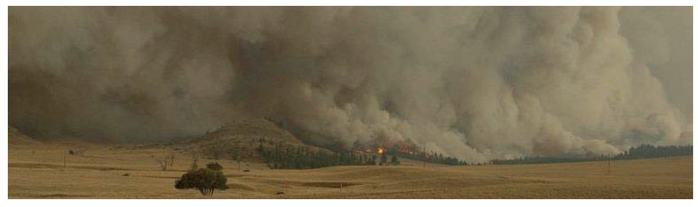
Wildfire and smoke

The non-thermal effects of a wildfire (smoke and soot) may affect a location even if the thermal effect (fire) never gets close enough to cause on-site fire damage.