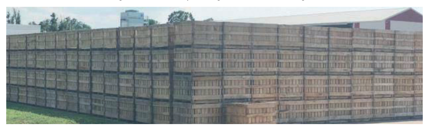
Combustible yard storage, wood bins

Second, wildfires may spread as air borne embers as far as 3 to 5 km (2 to 3 mi.). These embers may present sufficient energy to ignite distant combustibles such as dried vegetation, combustible yard storage, and combustible building features.