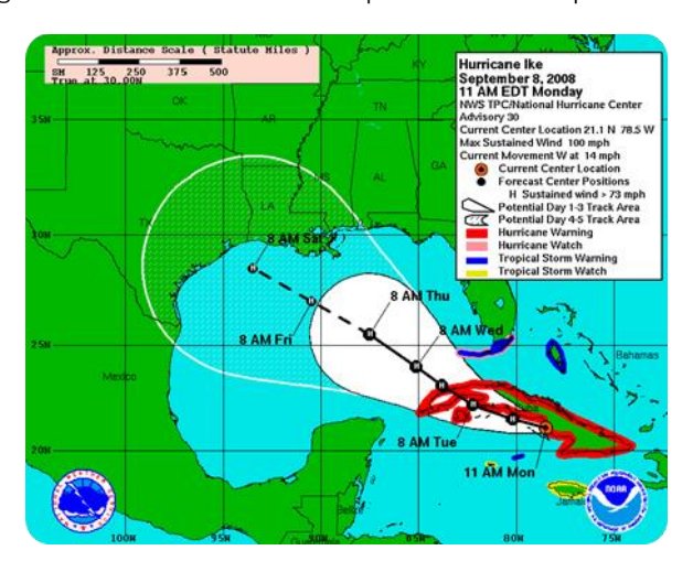
Figure 2. Hurricane Ike - Coastal Watches/Warnings and 5-Day Track Forecast Cone.

As a hurricane develops in the North Atlantic and Northwest Pacific, the National Hurricane Center issues a sequence of maps showing hurricane watch areas, hurricane warning areas, the past hurricane track and the potential hurricane track. Figure 2 below shows an example of such a map.