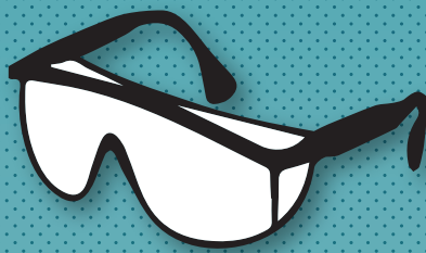
Laser Safety Goggles